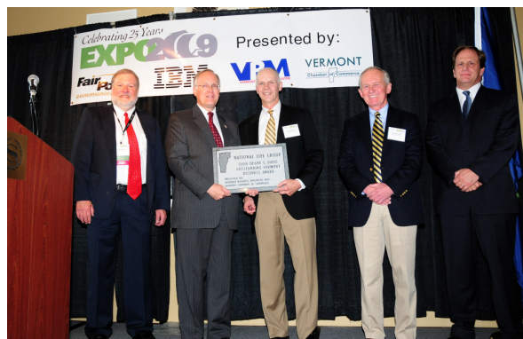
National Life 2008 Deane C. Davis Outstanding Vermont Business Award Recipient